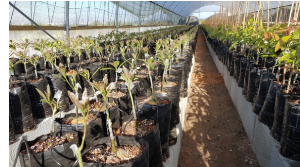
GROWING THE GRAFTED PLANT